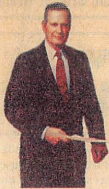
Former president George Bush was hospitalized Thursday with a heart problem. Page 7

Weather: Partly cloudy, chance of rain. Page 12